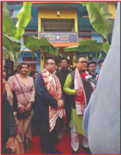
Women Hostel Innauguration