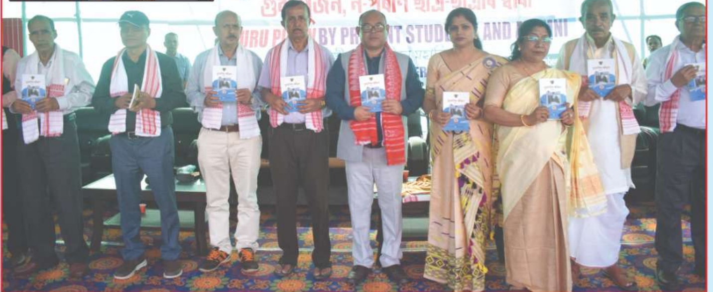
Innauguration of Books