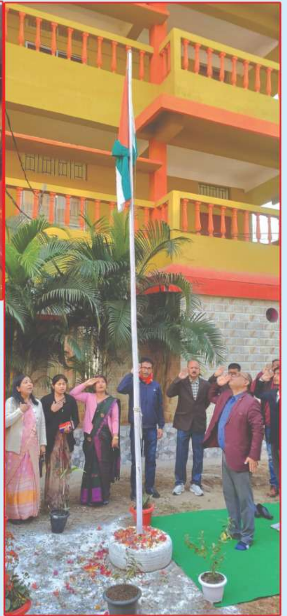
Independance Day, 2023