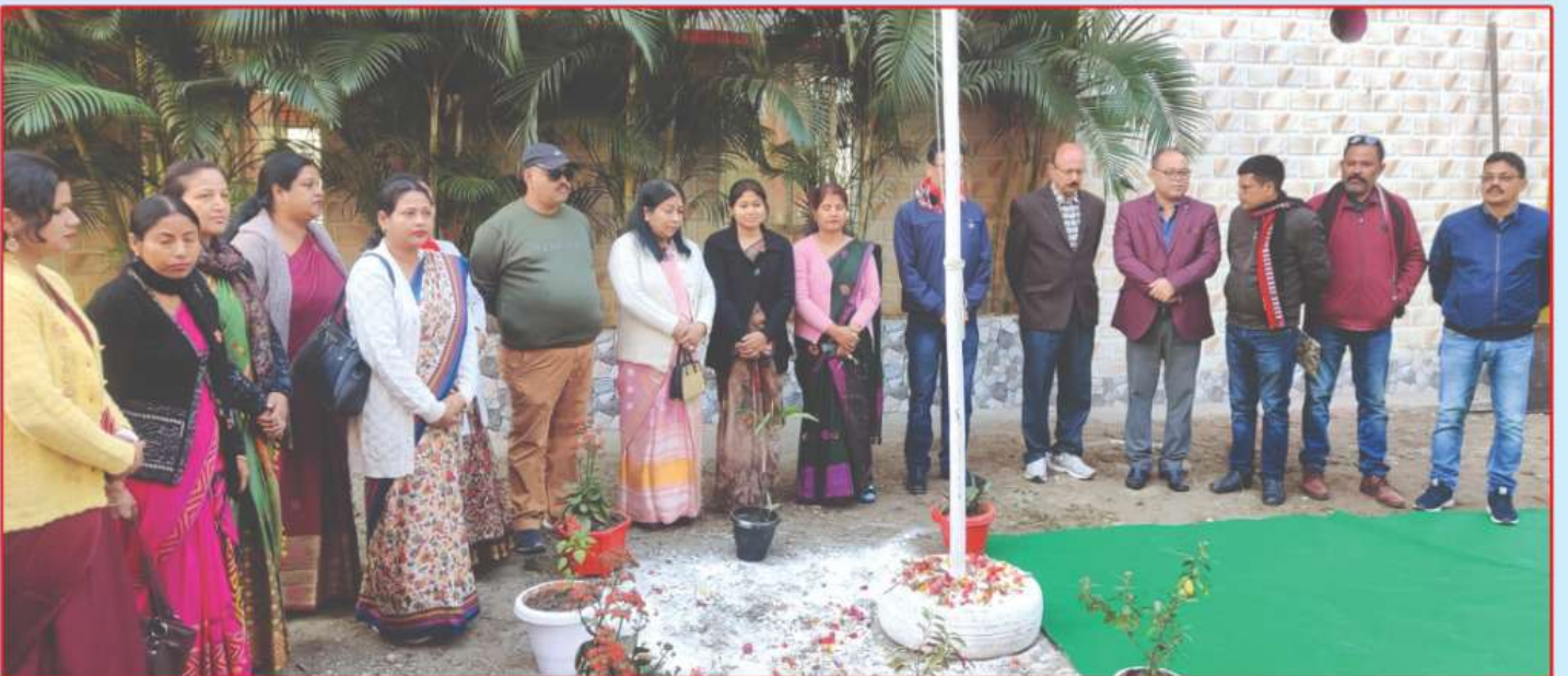
Independance Day, 2023