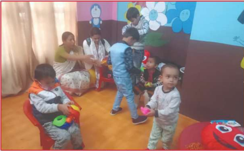
College Day Care Centre