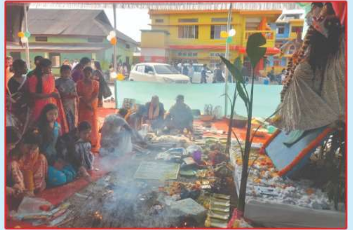
Swarasati puja in college campus