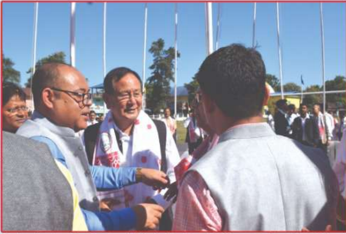
Principal with Central Minister Dr. Rajkumar Ranjan Singh