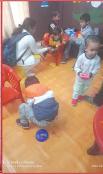
College Day Care Centre